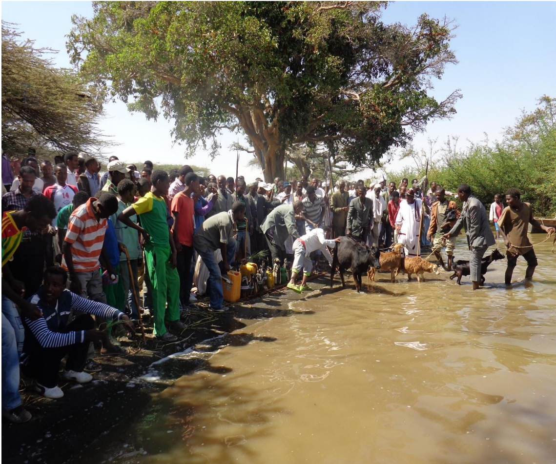
Figure 1. Malkaa Booreessuu.

Adami Tulu Culture and Tourism Bureau. Unlike in the past, the arrangement, performance, and or law enforcement for Tajoo ritual is largely determined by local government officials. The district officials facilitate it; sometimes, they even fix the date of ritual, forced people to repeal ritual laws, for instance the laallee ritual. There are frictions between elders and local administrative on the performance of Tajoo ritual.