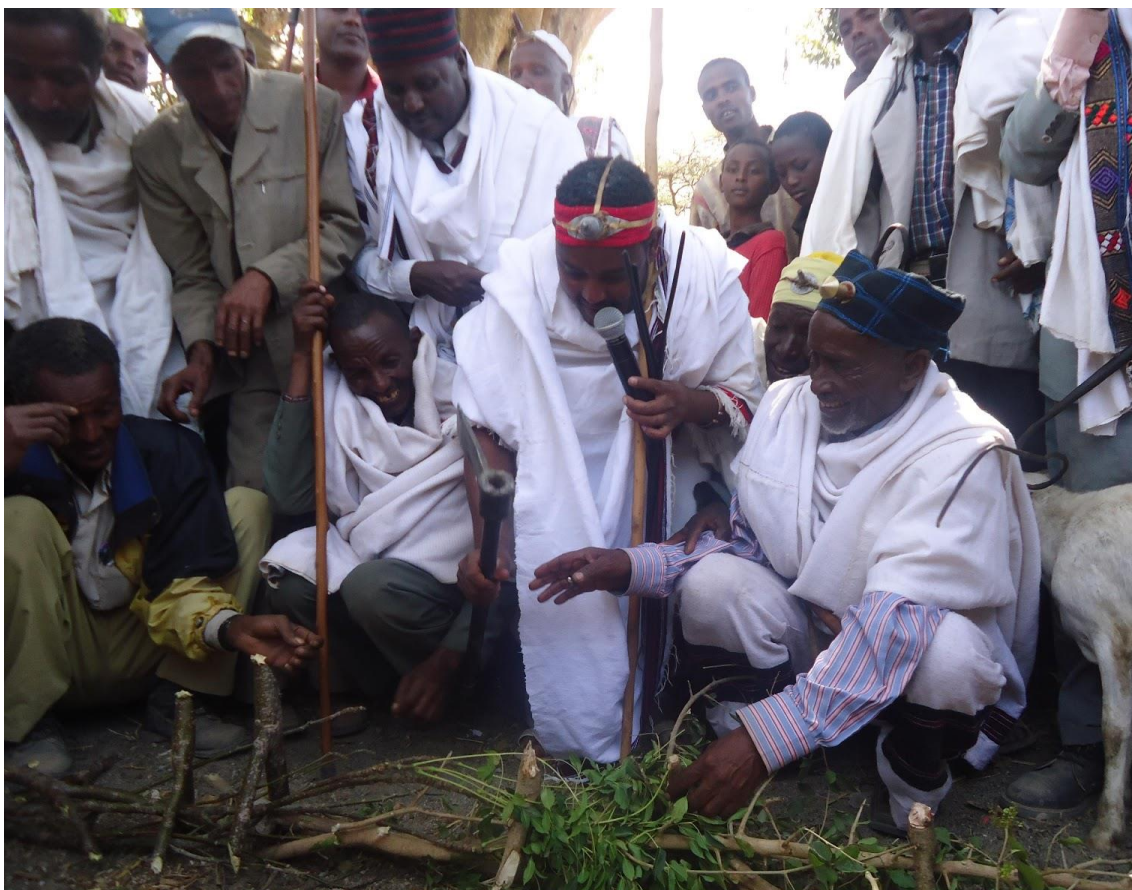
Figure 2. Gadaa Leaders erecting xiribbaa February 5, 2014.

the supernatural to restore balance, harmony, and peace to the humanity.