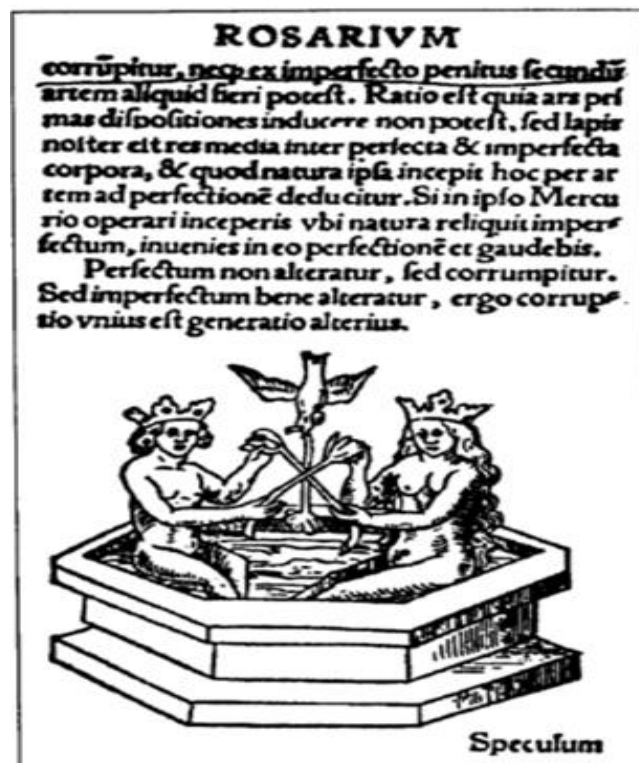
Figure 2. Trinity

The Genesis of the five books of Moses has two parts about the scene where God creates a man. The first part ( Genesis 1:1-2:4) is about Elohim the Creator making the first human. He starts the world with light, makes organisms on earth, and then works on the human looking like him. He even makes both man and woman